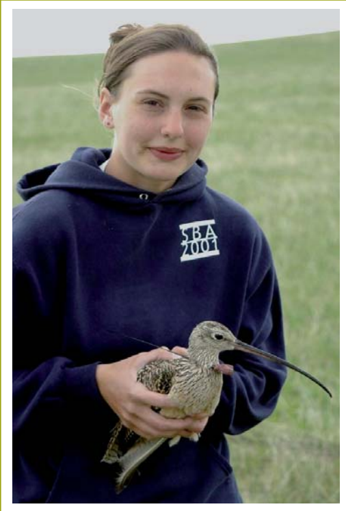
Long Billed Curlew/Kent (KC) Jensen, South Dakota State University

listings. The key to healthy people and healthy wildlife is habitat - clean air and water, healthy and diverse landscapes, and other features that help fish and wildlife thrive.