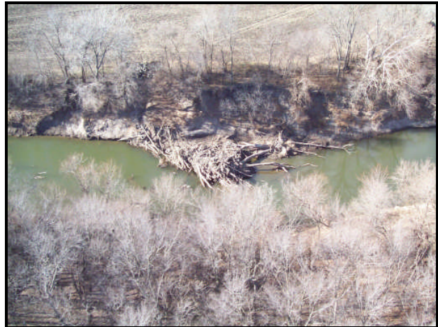
LWD ON COTTONWOOD RIVER

LWD is typically and most efficiently transported through the thalweg—the line connecting the deepest portion of a stream (Abbe et al. 2003). Abbe and Montgomery (2003) used aerial photographs and field surveys to classify different types of LWD jams. For the Neosho River logjam, it is representative of a transport jam where LWD is moved downstream by fluvial process until discharge decreases or material comes to rest on channel obstructions (Abbe and Montgomery 2003). Currently, the logjam extends approximately 2.25 miles upstream from a feature named the “horseshoe” (see Appendix A, Figure 7). By reducing stream velocities and inducing sediment deposition, JRR becomes the initial channel obstruction leading to LWD accumulation. KBS (2007) recently completed a bathymetric survey of JRR and found that the lake at the Neosho River confluence is approximately 1 foot deep near the conservation