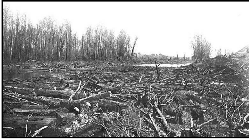
PHOTO 11 GREAT RED RIVER RAFT