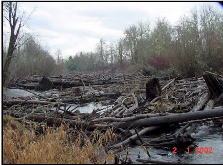
PHOTO 14 DESCHUTES RIVER LOGJAM