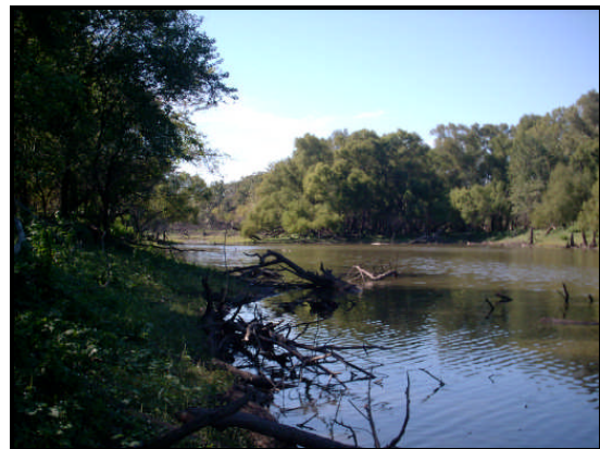
OPEN WATER ABOVE HORSESHOE