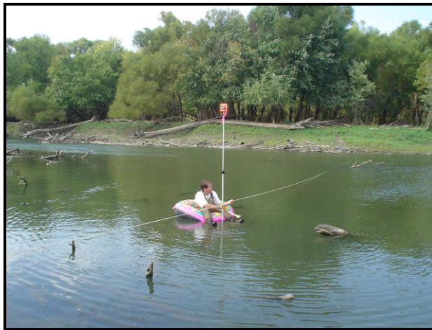
PHOTO 7 TWI CROSS SECTION SURVEY

TWI analyzed the survey data using RIVERMorph stream restoration software (RIVERMorph 2001-2007). RIVERMorph plotted each cross section and determined the bankfull channel dimensions based on TWI identified bankfull indicators. The bankfull channel corresponds to the discharge that is most effective at channel maintenance and produces the average morphologic characteristics of channels (Dunne and Leopold 1978). Bankfull indicators include a change in bank slope, scour lines, and the top of sediment deposits. For the Neosho River cross sections, TWI found the top of bank or a change in bank slope to be a consistent bankfull indicator. Table 3 summarizes the bankfull channel dimension. Plots from each cross section are found in Appendix B