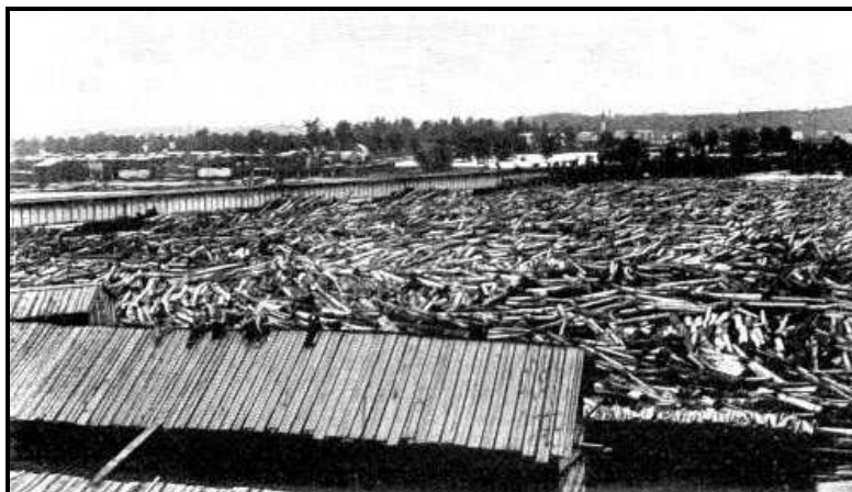
PHOTO 12 GRAND RIVER LOGJAM