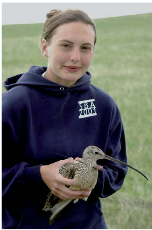
Long Billed Curlew

listings. The key to healthy people and healthy wildlife is habitat - clean air and water, healthy and diverse landscapes, and other features that help fish and wildlife thrive.