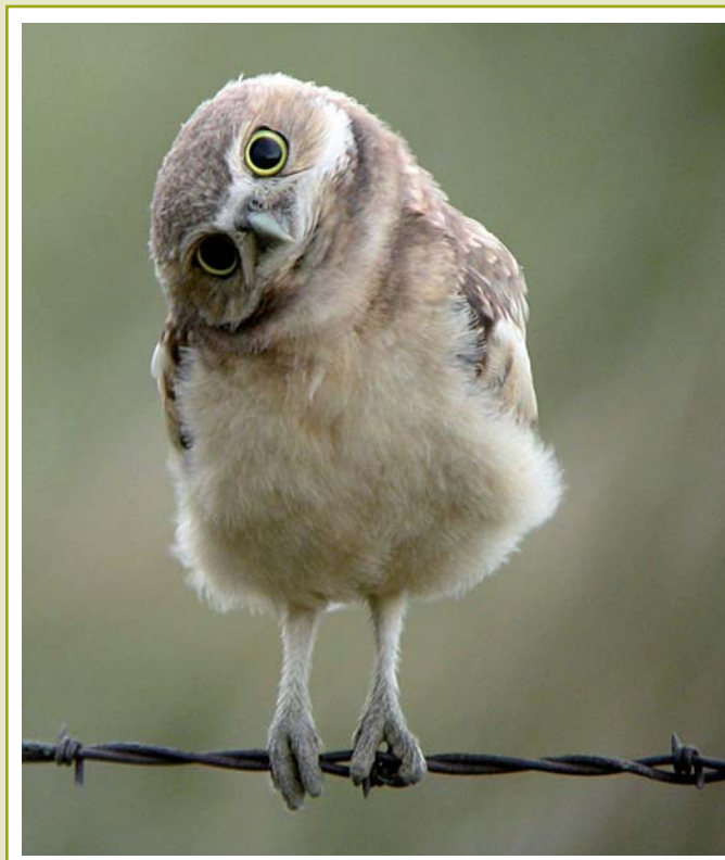
Burrowing Owl/Doug Blacklund

grasslands support many species found in few other places in the state, such as the American dipper, Townsend's big-eared bat, and the longnose sucker.